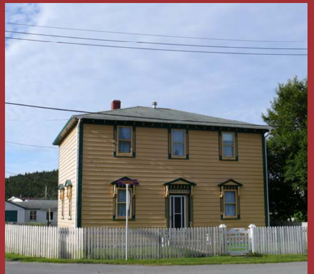
Riverside Drive, Placentia

During that same time Placentia hosted its fourth annual Doors Open event. Many of the buildings within the inventory area were also open for the day, giving access to the public for free. O’Rielly and Maynard were able to visit many of the sites while conducting the historic building inventory.