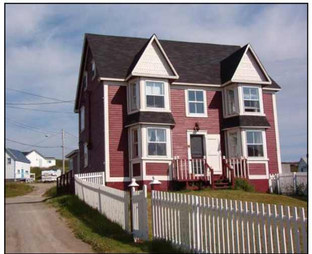
Harding House Registered Heritage Structure, Greenspond