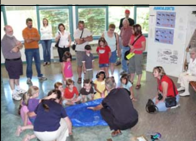
Visitors during Doors Open St. John's watch the Fluvarium's demonstration of the bugs that inhabit our freshwater.