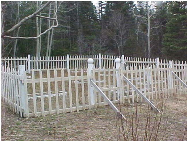
Old Catholic Cemetery Municipal Heritage Site, East Tickle, Leading Ticksles

View listings for these and other historic places in Leading Ticksles and around the province on Newfoundland and Labrador's Provincial Register of Historic Places, hosted on HFNL's web site at www.heritagefoundation.ca .