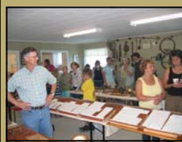
The doors were open at the Gillams' Historical Society Museum as part of Corner Brook's Doors Open event on August 20th, 2008.