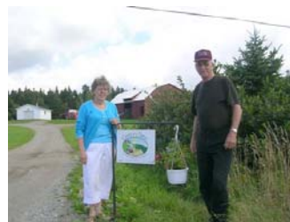
Standing at the farm gate showing their Century Farm sign. White's Farm, Tompkins, NL.

The Agricultural History Society of Newfoundland and Labrador created the Century Farm Award in 2006 to honour families in the province who have been farming their land continuously for one hundred years or more.